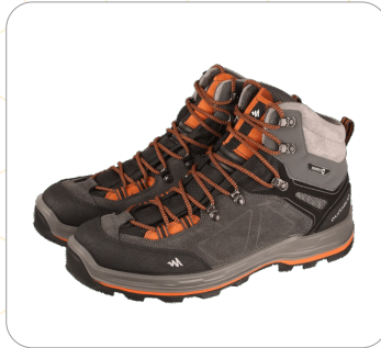
TREKKING SHOES RS.600

Note:- Rest gears are available for purchase.