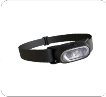
HEAD TORCH RS.250