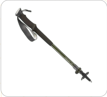
TREKKING POLES RS.250