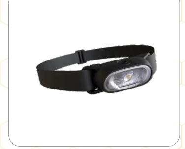
HEAD TOURCH RS.250