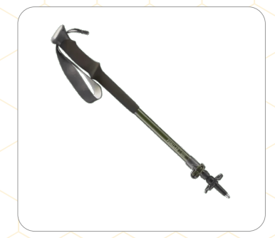
TREKKING POLES RS.250