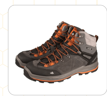
TREKKING SHOES RS.600

Note:- Rest gears are available for purchase.